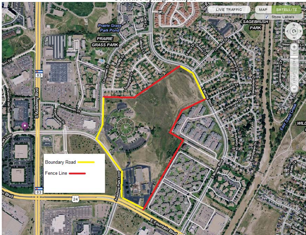
Colorado Springs Campus

Based on the definition above and the guidance provided in The Handbook for Campus Safety and Security Reporting, 2016 Edition, Nazarene Bible College has identified its Clery Geography to be within the boundaries drawn below: